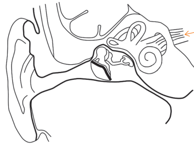
Figure 1 Area inside the inner ear where tumours grow

A Computed Tomography (CT) or Magnetic Resonance Imaging (MRI) scan can show the presence of an acoustic neuroma, even those that are still in the internal ear canal (Figure 1).